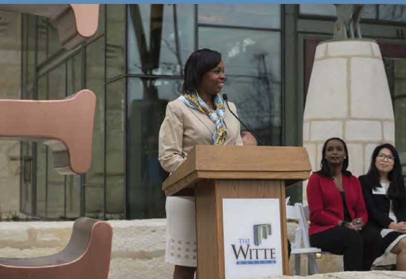
Mayor Ivy Taylor address crowd at New Witte Ribbon Cutting