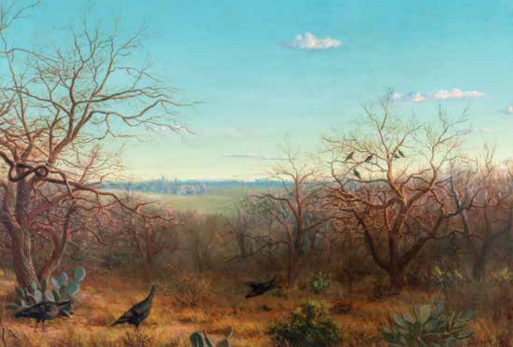
Turkey in the Brush