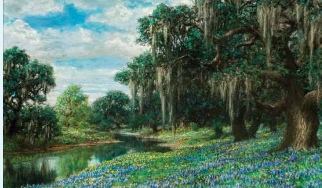
Mossy Oaks and Bluebonnets