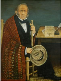
Portrait of Sam Houston, William M. Samuel, Witte Museum Collection.