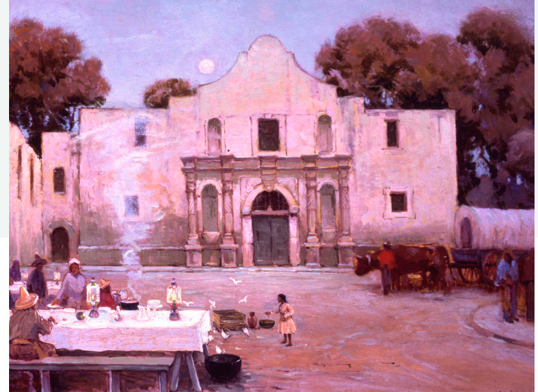
Chili Queens at the Alamo. Julian Onderdonk.