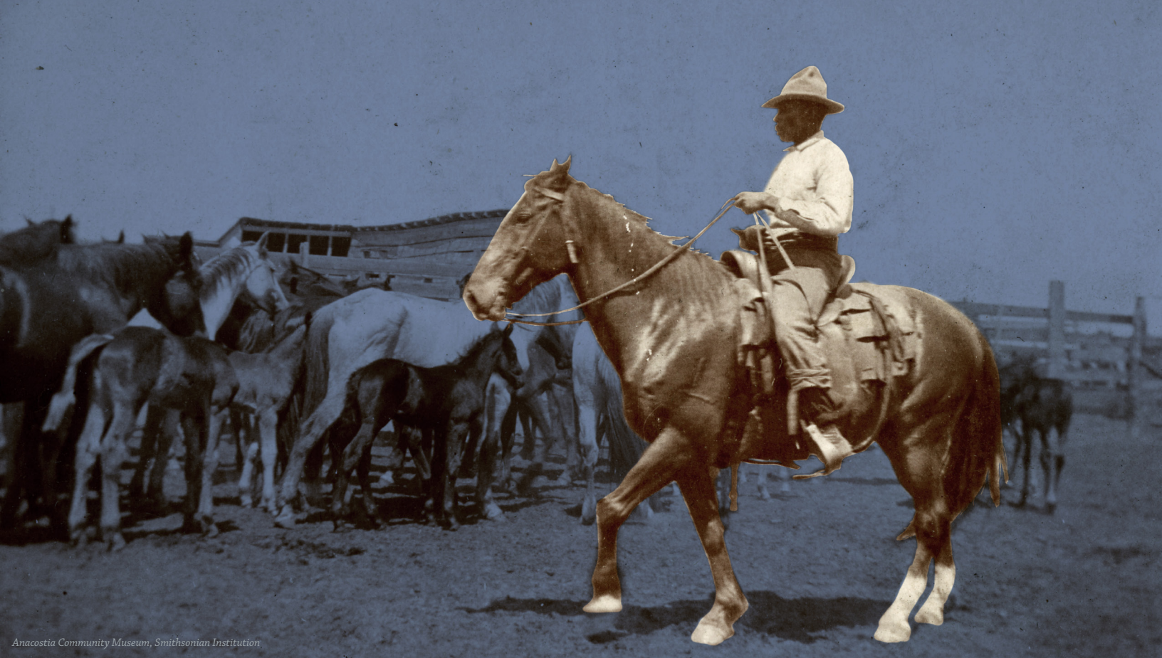
Anacostia Community Museum, Smithsonian Institution