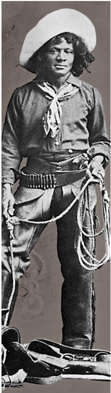
Nat Love