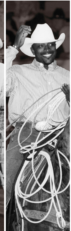
Fred Whitfield